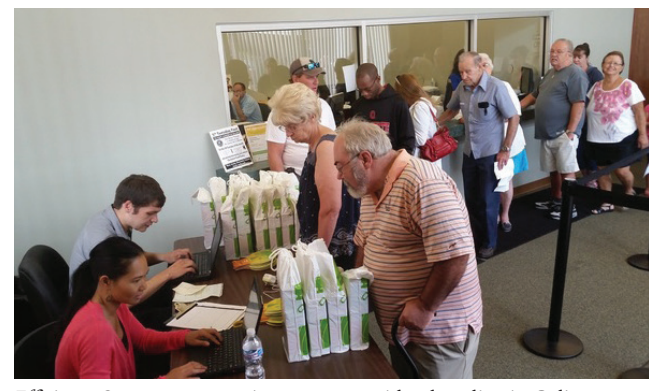
Efficiency Smart representatives were met with a long line in Galion during a Customer Appreciation Day event.

During the event, residents received free compact fluorescent light bulbs (CFLs) to reduce their lighting costs