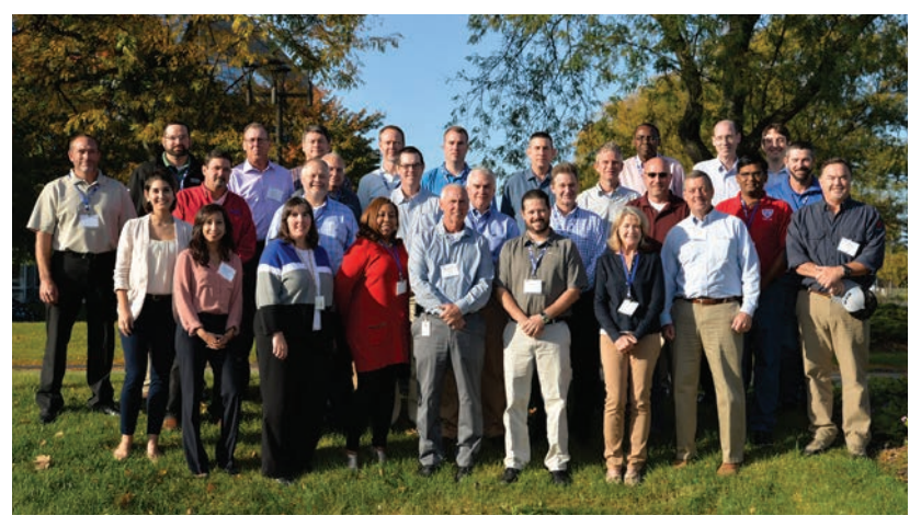
The APPA RP3 program committee held its first offsite meeting Oct. 24-25 at AMP.