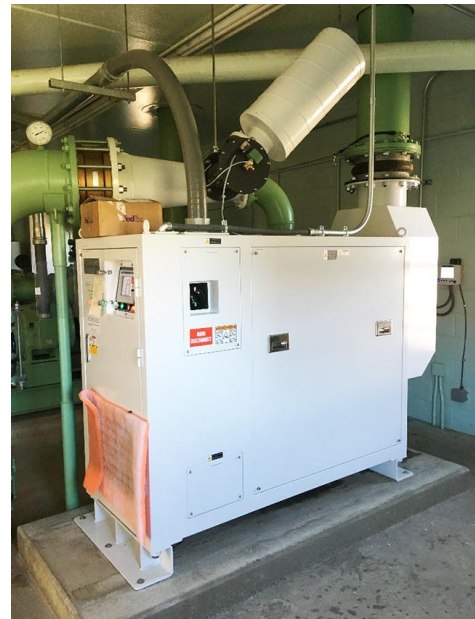
The City of Wadsworth's new aeration blower system at its wastewater treatment plant

For more information regarding Efficiency Smart's services, visit www.efficiencysmart.org or call 877.889.3777.